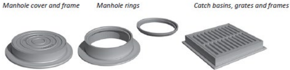
Figure I-1 Examples of heavy castings