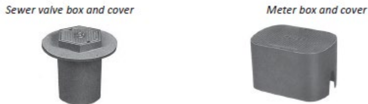
Figure I-2 Examples of light castings