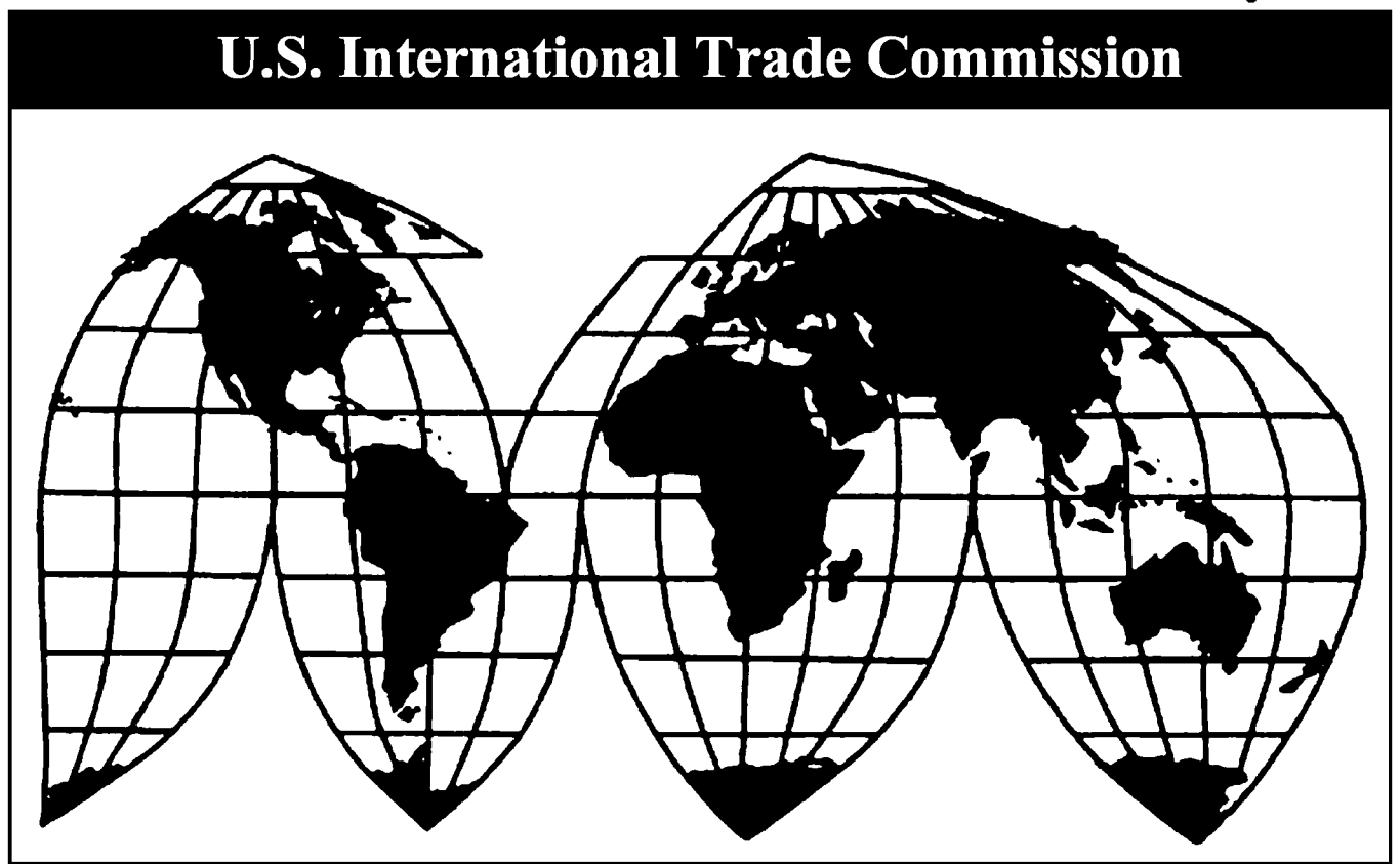
Washington, DC 20436