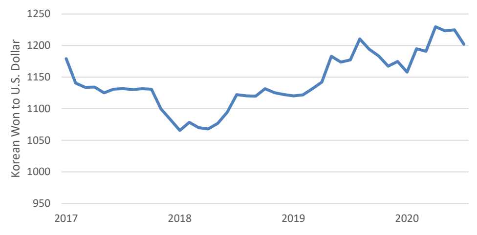
Figure V-1 Exchange rates: Korean won to U.S. dollar exchange rate, weekly, January 2017 to June 2020