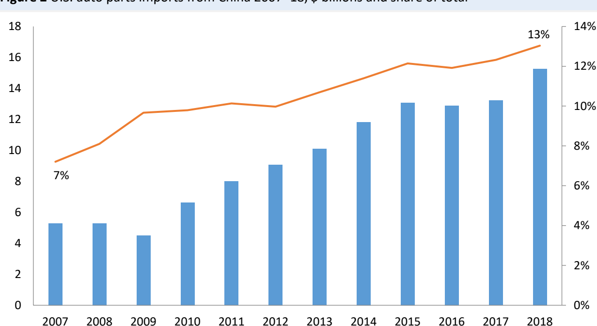
Figure 2 U.S. auto parts imports from China 2007–18, $ billions and share of total

U.S. imports of automotive parts from China have grown significantly, both in terms of value and share of U.S. imports (figure 2), reaching $15 billion and 13 percent of U.S. parts imports in 2018. U.S. imports from China accounted for an estimated 3.9 percent of U.S. automotive parts consumption in 2016 (most recent year available for U.S. parts production).<sup>39</sup> Examining which parts the United States imports from China provides a clearer picture of China's participation in the U.S. vehicle manufacturing supply chain. This section will break down trade by 5-digit NAICS code, and (where relevant) 8 or 10-digit HTS subheading.