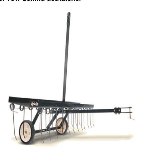
Figure I-2 TBLGs: Tow-behind dethatcher