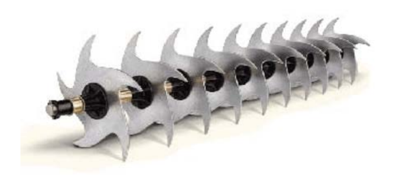
Figure I-10 TBLGs: SmartLINK turf shark curved blade aerator