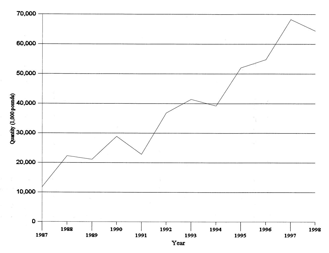
Figure I-1 PET film: U.S. imports from Korea, by quantity, 1987-98