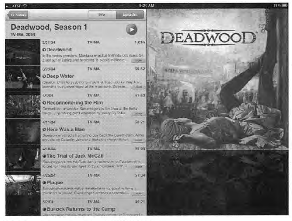
CDX-0090 (showing screenshot of CPX-0053).

The Apple iPad running the iTunes Application practices element 1c of claim 1 of the '762 patent. Selecting one of the purchased TV shows causes an episode display screen to be displayed, as depicted in the following screenshot from an Apple iPad running the iTunes application. CX-5750C (Shamos WS) at Q774.