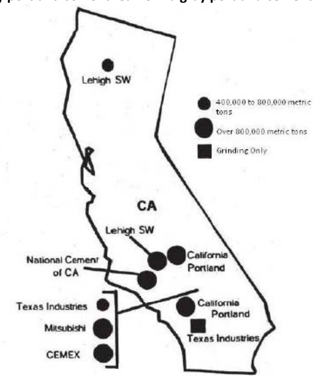
Figure I-2 Gray portland cement: California gray portland cement plants, 2015