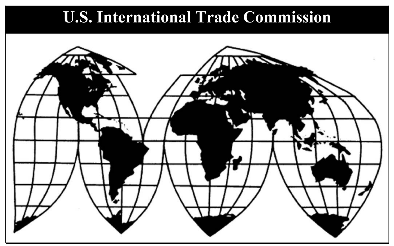
Washington, DC 20436