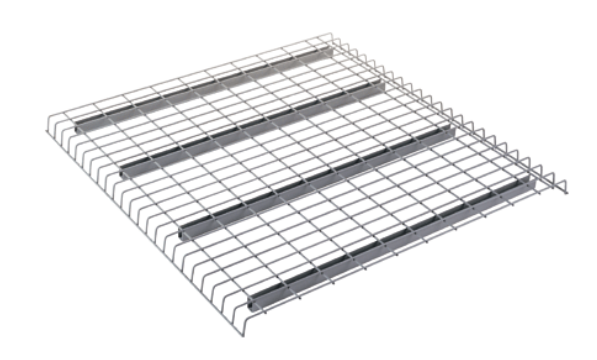
FIGURE I-1 Standard waterfall decking

A decking section comprises a steel wire mesh shelf with attached reinforcing supports ready for installation on supporting rack framing (Figure I-1).